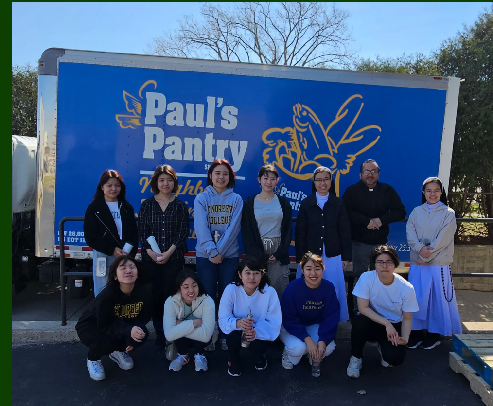
Caption: Spring 2, 2023 ESL students at a service project at Paul's Pantry